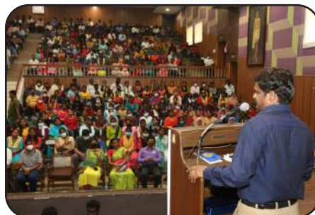
Ethiraj College, Chennai