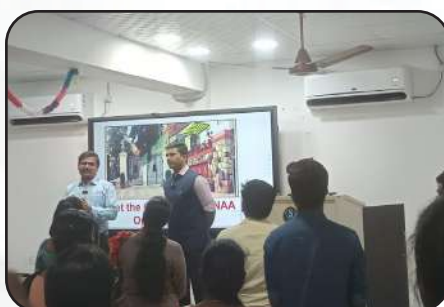
Branch Office - Nellai