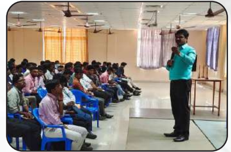
velammal engineering college, Chennai