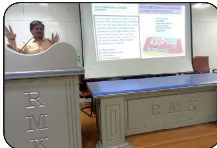
RMK college, Chennai