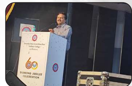
D.G Vaishnava college Chennai