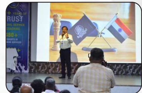
Hindustan college, Coimbatore