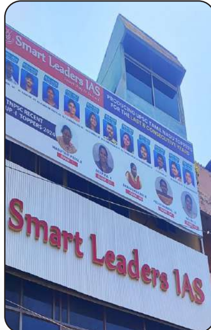
Chennai Extn, Thirumangalam, Anna Nagar, Chennai.