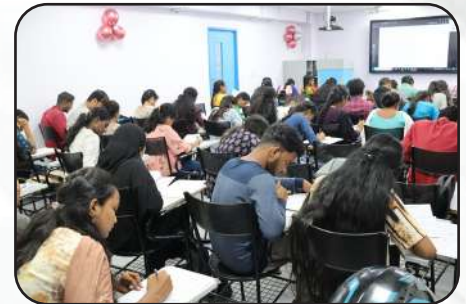
Head Office, Anna Nagar, Chennai.