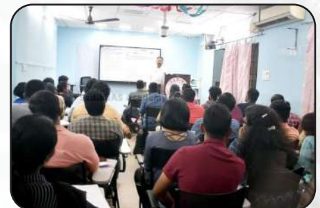
Chennai Extn, Thirumangalam, Anna Nagar, Chennai.