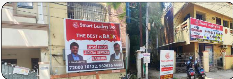
Chennai Extn, 15th Main Rd., Anna Nagar, Chennai.