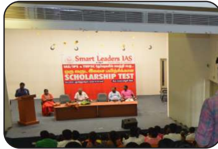
Sona College, Salem