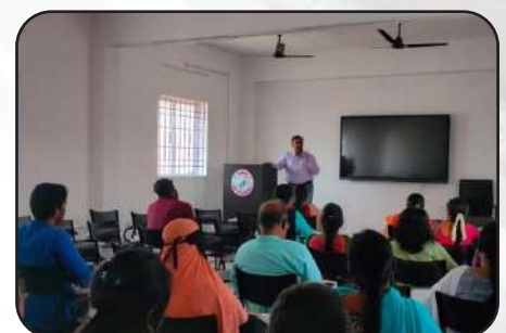
Branch Office - Krishnagiri