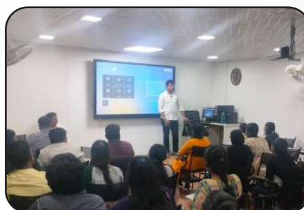
Branch Office - Trichy