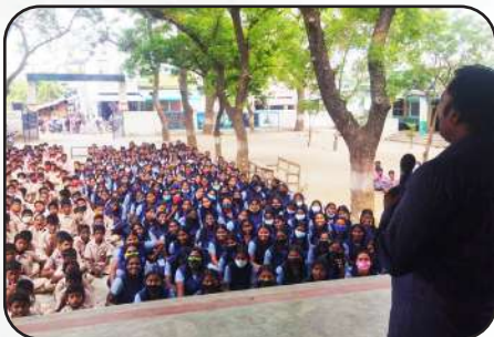
Government High School Thalaivasal