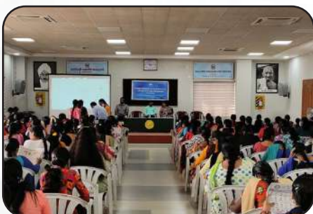
Kauvery College, Trichy