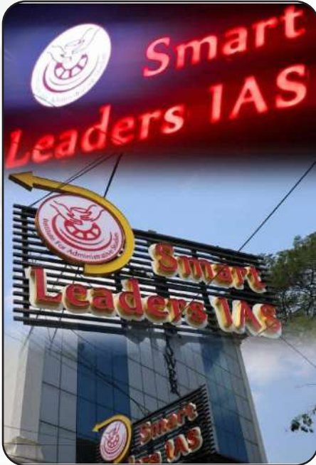
Head Office , RBN Tower, Shanthi Colony, Anna Nagar, Chennai-40.