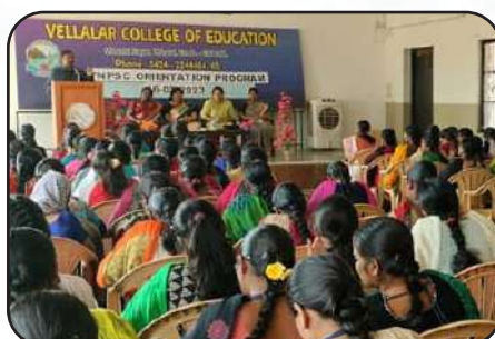
Vellalar College Of Education Erode