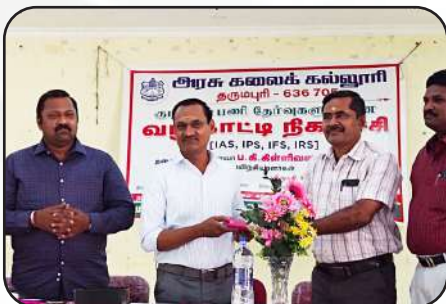
Government Art College, Dharmapuri